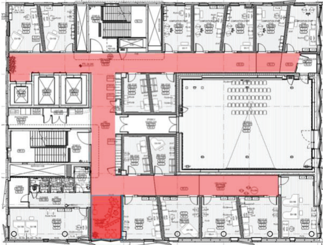
Figure 4 – Corridor layout with open plan study area on level 5

The building is designed to promote well-being for all occupants by incorporating open study areas leading from the corridors. This encourages a collegiate approach to practical music training through the interaction of all users of the building.