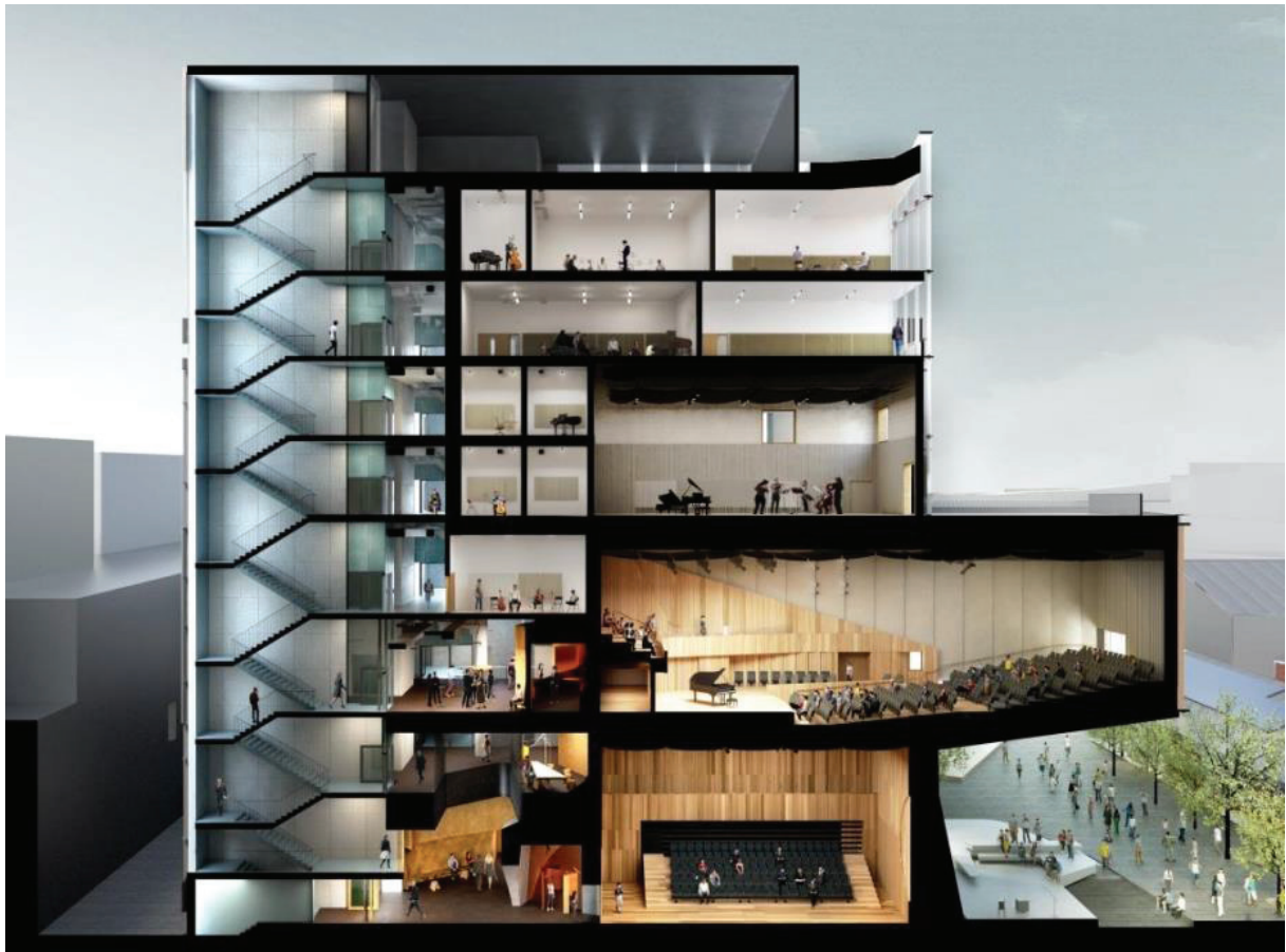
Figure 1 – Section view of the Conservatorium building provided by the architect

A section through the building is shown in Figure 1.