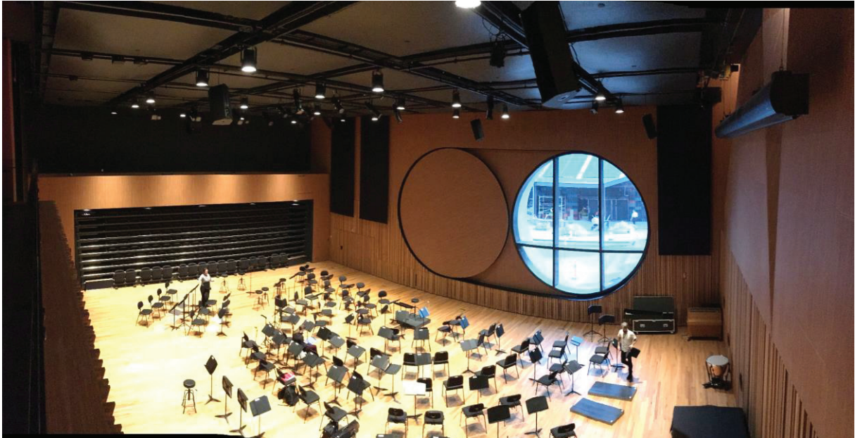
Figure 2 – Interior of the Kenneth Myer Auditorium from the viewing gallery

Figure 3 shows the large studio on level 3, named the Hanson Dyer Hall. This is the main performance venue. It has fixed raked seats for an audience of 400, a fixed stage and a choral balcony for 35. It is not designed for use by large ensembles. This is an intimate space that responds well to musical nuances. Operable banners are installed on the upper side and rear walls with fixed absorption provided by the perforated panels between them.