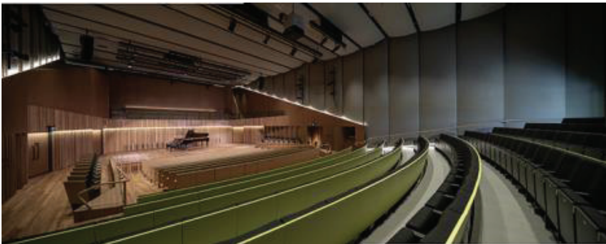
Figure 3 – Interior view of the level 3 Hanson Dyer Hall

Ceiling panels of single curvature distribute sound along the hall, and diffusion on the front walls of the room distribute early lateral energy to promote envelopment. Along the rear side walls weaker diffusion is provided by curved wall panels that provide a visual link to the ceiling form.